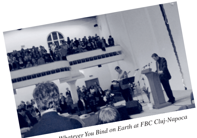
Teaching Whatever You Bind on Earth at FBC Cluj-Napoca