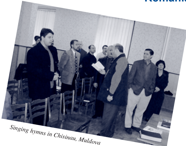
Singing hymns in Chisinau, Muldova